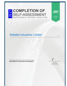
SUSTAINABLE APPAREL COALITION